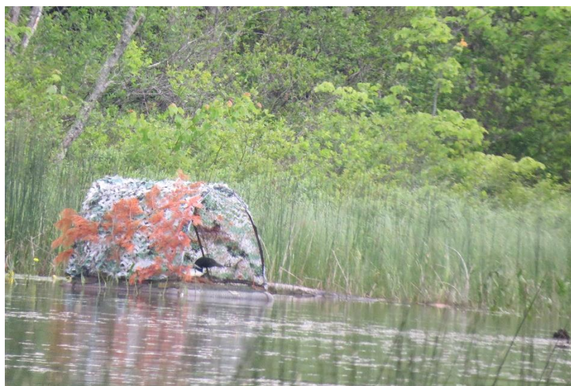
Figure 6. Nesting Loon, Robbins Mill Raft, Great Pond.