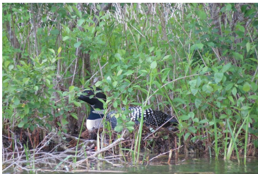
Figure 2. Nesting Loons, Ram Island, Great Pond.