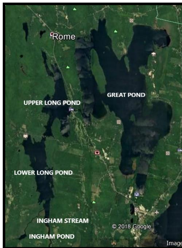
Figure 1. The Belgrade Lakes Study Area.