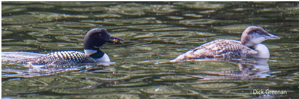
Figure 3. Adult and chick, 2024.